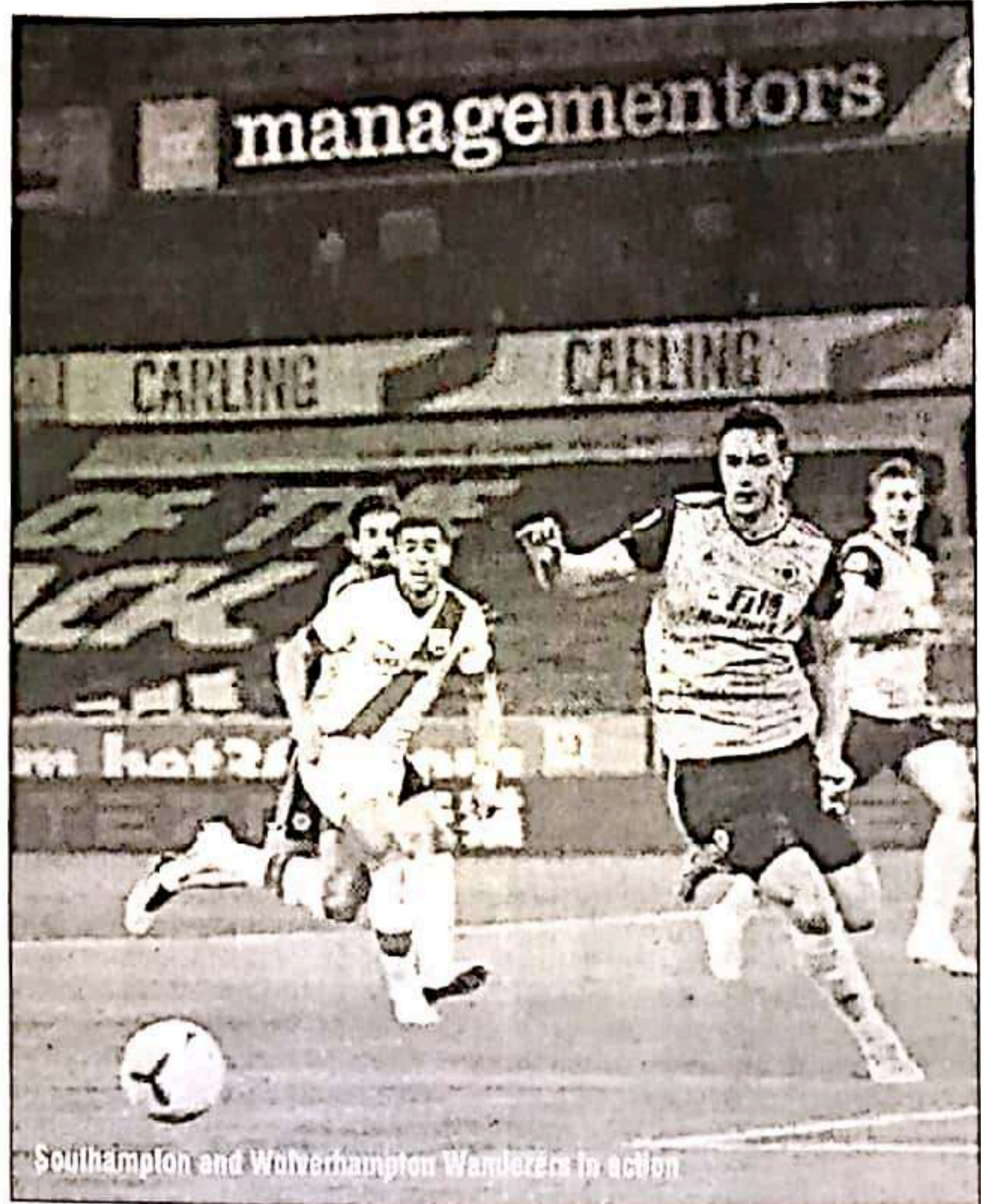
Southampton and Wolverhampton Wanderers in action

FPJ NEWS SERVICE Wolverhampton Substitute Pedro Neto cancelled out Theo Walcott's second-half goal for Southampton to earn Wolverhampton Wanderers a 1-1 draw in the Premier League at Molineux, here on Tuesday. A double-save on six minutes by Alex McCarthy from Raul Jimenez and Leander Dendoncker set the scene for a fine performance from the Southampton goalkeeper, while Walcott brought a good stop from Rul Patricio at the other end. The on-loan Everton forward Walcott, netted for the visitors for the first time since January 2006, early in his first spell for the south-coast club, to give them the lead in the 59th minute at Molineux on Monday. Pedro Neto came off the bench to equalize in the 75th, turning in a rebound after Raul Jimenez's shot came off the post. Stuart Armstrong then dragged a shot just wide after a flowing Saints move before Daniel Podence's flicked header for Wolves brought an even better save from McCarthy. Podence threatened for the hosts again early in the second half but Saints broke the deadlock on 58 minutes when Che Adams drilled a low cross for an unmarked Walcott